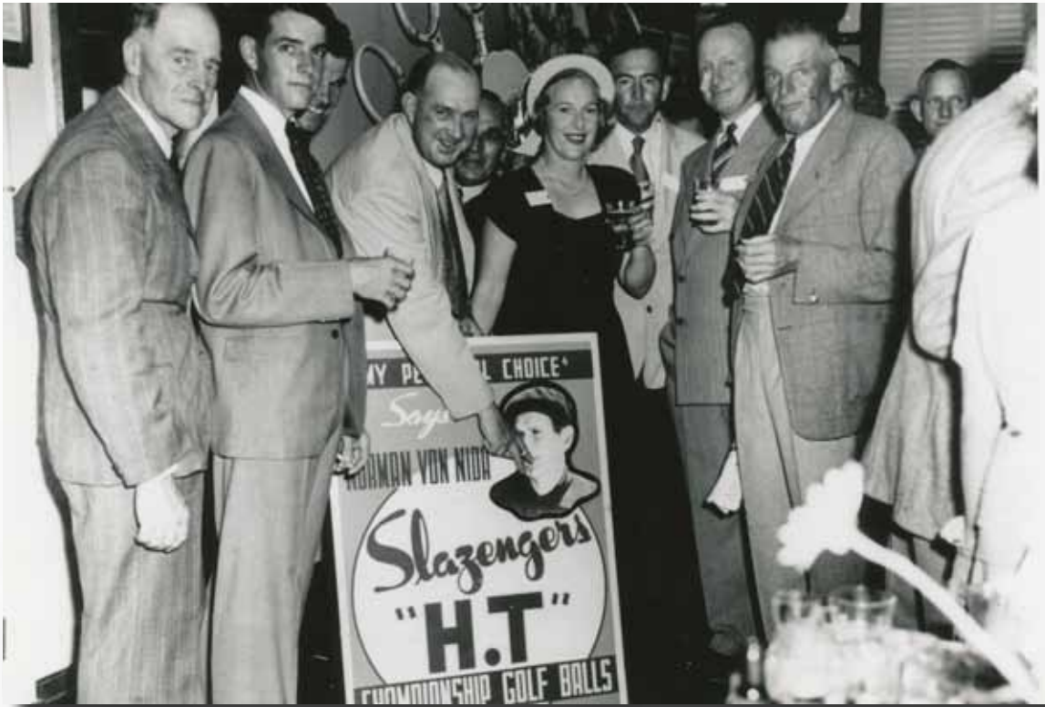
1950's Slazengers function for Qld Golf Professionals: