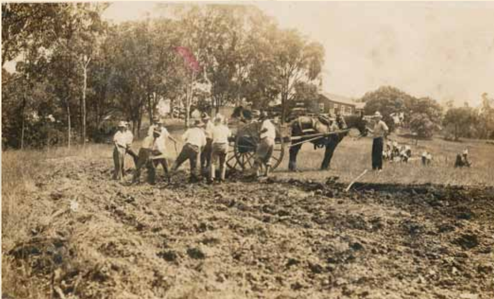
A club working bee in their Sunday best (circa 1926).

An interesting aside is the fact that at the end of the first year the 319 members comprised 175 women and 146 men.