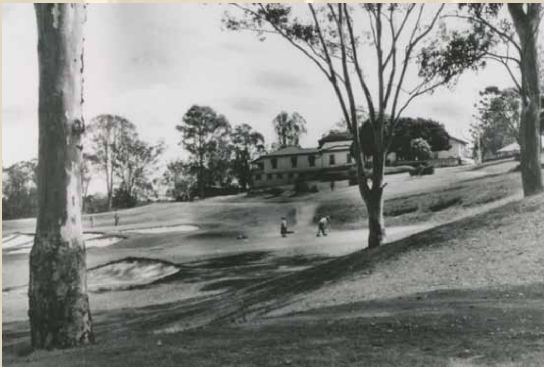
1960s photograph of the St Lucia clubhouse taken from the 10th tee.