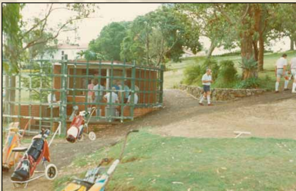
Half-way house at St Lucia – a welcome stop for refreshments.

At the end of 1985 club members and associates said goodbye to the "Grand Old Lady". The excitement of the move to the new complex with its longer and more challenging courses and palatial clubhouse was tinged with sadness in leaving a venue steeped in tradition and happy memories.