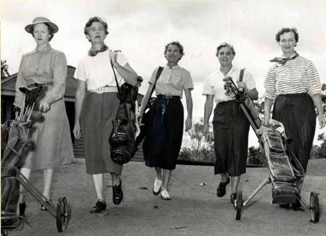
1950s photograph of associates at St Lucia

By 1956 membership had more than doubled since the war to 898, forcing the club to put a ceiling on future applications. With a fifteen year waiting list for membership and demand still increasing, the club purchased 140 riverside acres at Moggill to build an 18 hole championship course.