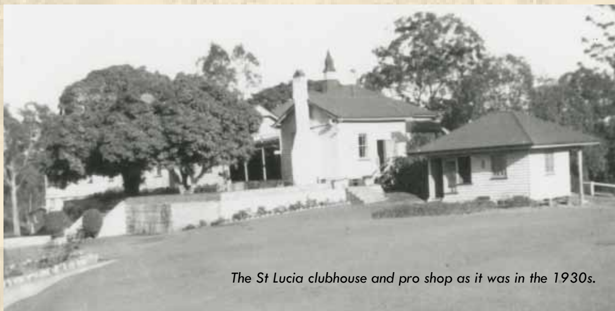
The St Lucia clubhouse and pro shop as it was in the 1930s.