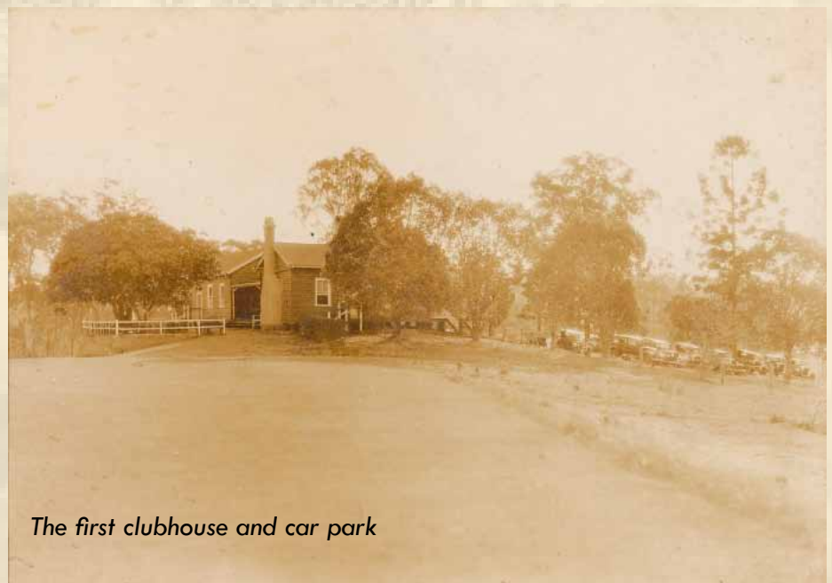
The first clubhouse and car park

A cutting from early newspaper announcing the opening of the Indooroopilly Golf Links.