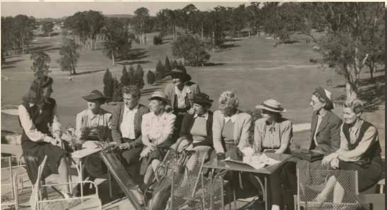
Another meeting of players and delegates at the same tournament.