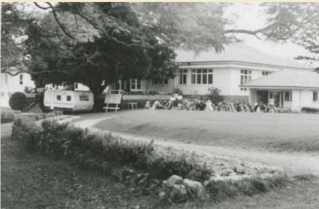
The St Lucia clubhouse and pro shop as it appeared in the 1970s.